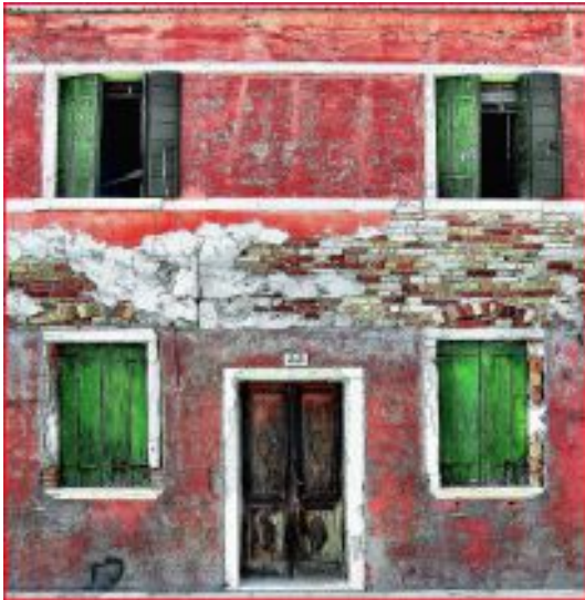
No. 35 by Gary Weaving

Here are some of the images put forward that evening: