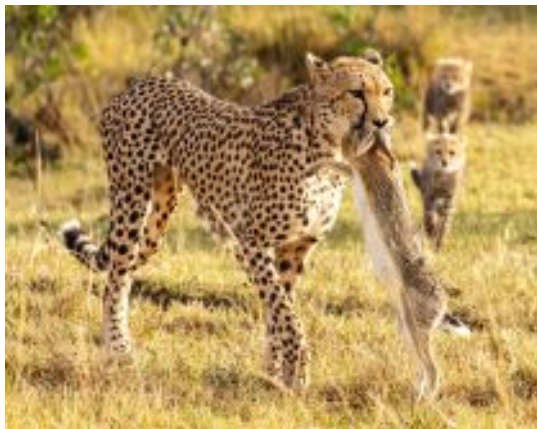
Cheetah With Kill