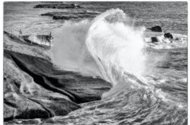
Crashing Spray