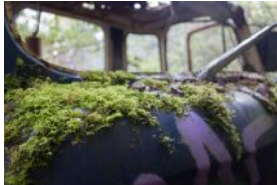
Nature Taking Over