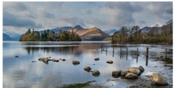
Derwent Water