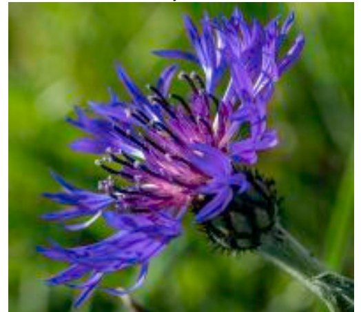
Corn Flower By Debbie Arnell