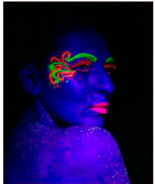
Second Place UV Light by Sue Leathers