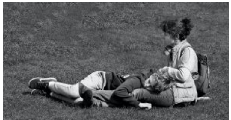
Mumm, can we go home now?