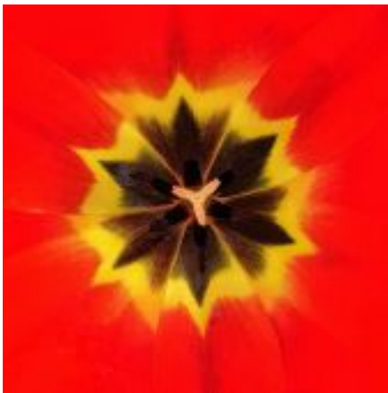
Tulip Kaleidoscope by Elvio Morcillo