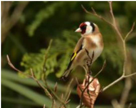
My Best Side by Kevin England