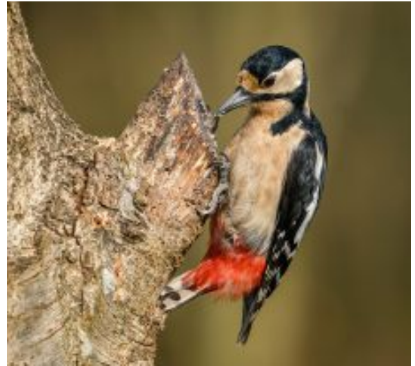
Looking for Lunch by Colin Churcher