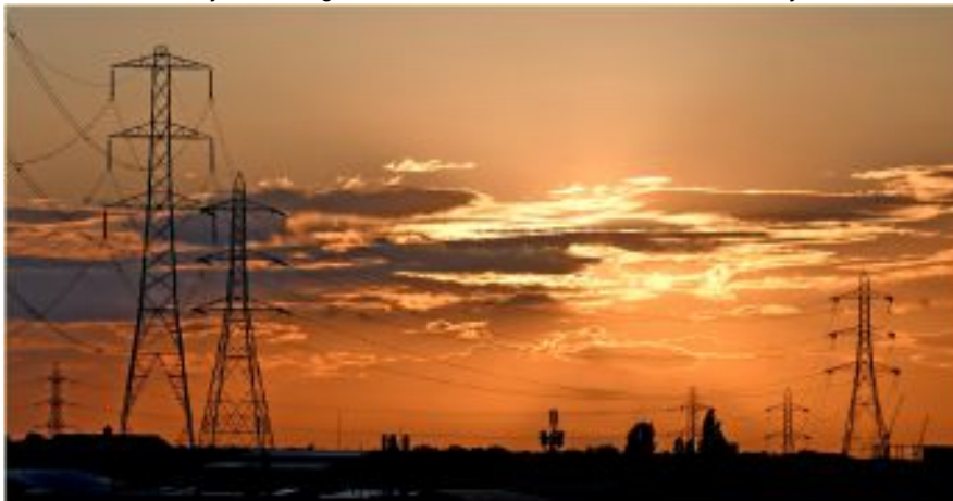
Industrial Landscape By Keith Wellbelove