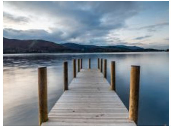
Ashness Jetty