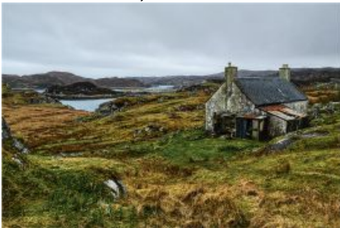
Home with a view by Graeme Wales