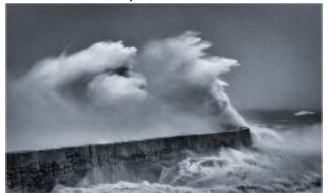
Facing Up To The Storm by Jonathon Bartle