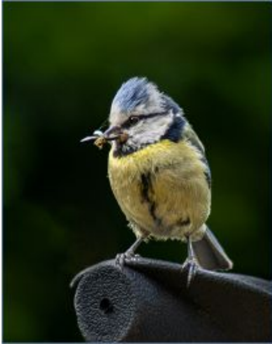
Blue Tit By Kevin Austin