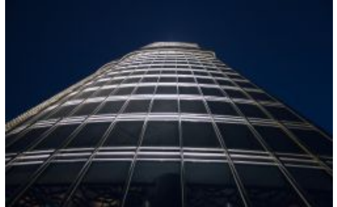
Kalifa Tower, Dubai