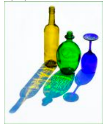
Reflections by Sue Leathers