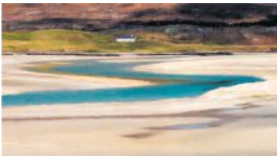
Harris Tweed Colours by Graeme Wales